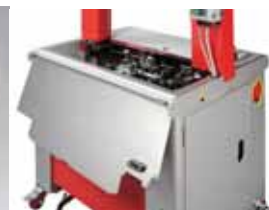
Hinged Open Tops